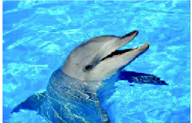
A dolphin is a social animal with a pointed beak.

Both porpoises and dolphins are toothed whales. However, porpoise teeth are shaped differently than dolphin teeth. Dolphins have sharp, cone-shaped teeth, but porpoise teeth are spade-shaped and flatter.