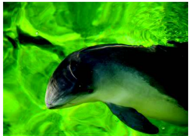
A porpoise is smaller and more shy than a dolphin. It has a rounded snout.